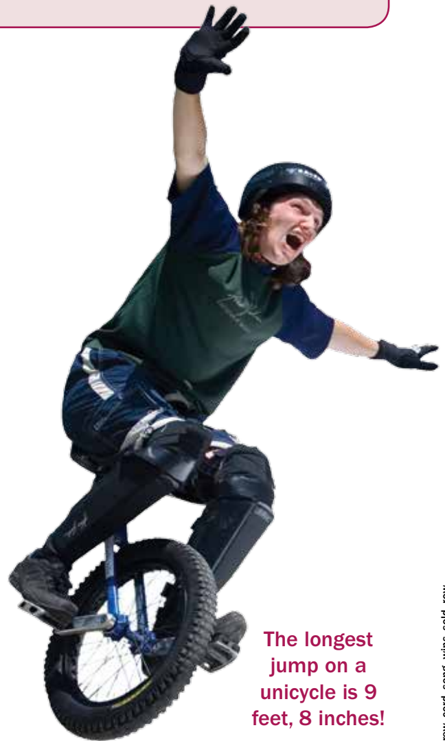
The longest jump on a unicycle is 9 feet, 8 inches!