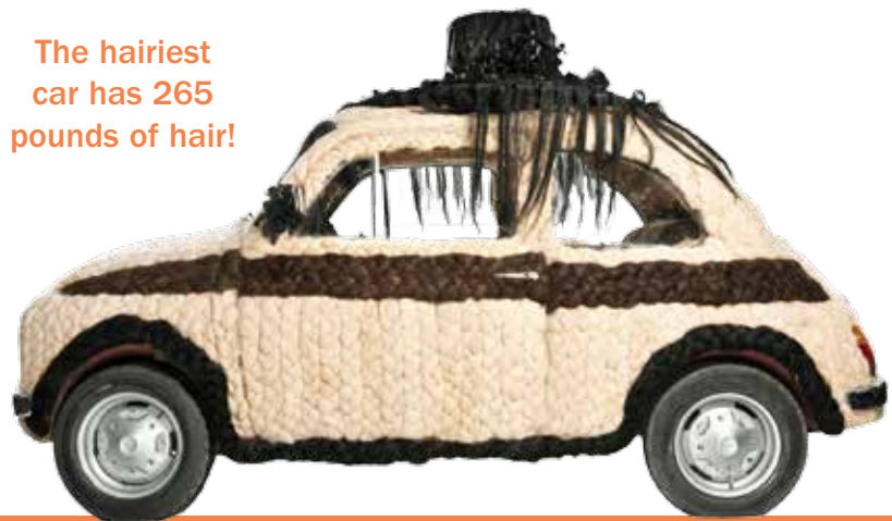
The hairiest car has 265 pounds of hair!