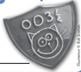
Illustration © Rob Scotton