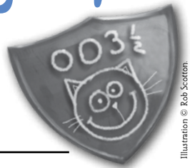
Illustration © Rob Scotton