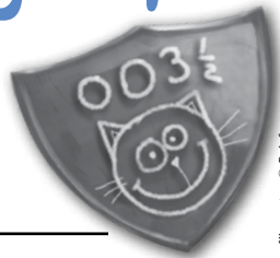
Illustration © Rob Scotton