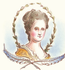
ESTHER DEBERDT REED