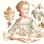
ELIZA LUCAS PINCKNEY