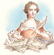
DEBORAH READ FRANKLIN