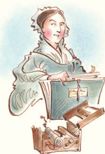
CATHARINE LITTLEFIELD GREENE

Answer Key: 1. Mercy Otis Warren; 2. Dolley Madison; 3. Esther DeBerdt Reed; 4. Eliza Lucas Pinckney; 5. Phillis Wheatley; 6. Deborah Read Franklin; 7. Catharine Littlefield Greene; 8. Martha Washington; 9. Sarah Livingston Jay; 10. Abigail Adams