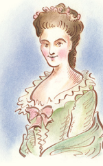
SARAH LIVINGSTON JAY