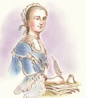
MERCY OTIS WARREN