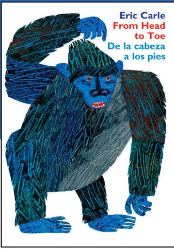
Eric Carle From Head to Toe De la cabeza a los pies